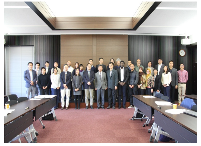
Fig 2. International Workshop The Japan-ASEAN Collaborative Research Program on Innovative Humanosphere in Southeast Asia