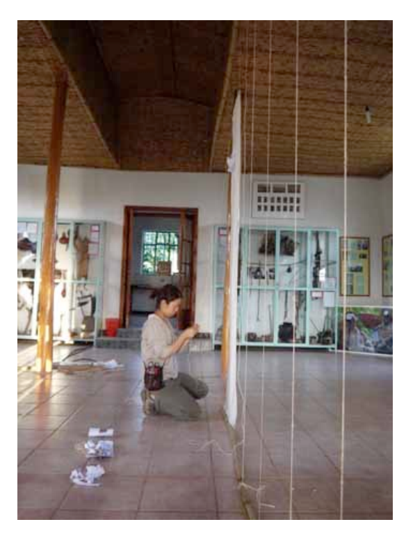
Photo 3 Making simple equipment for hanging ensete drawings at the exhibition.