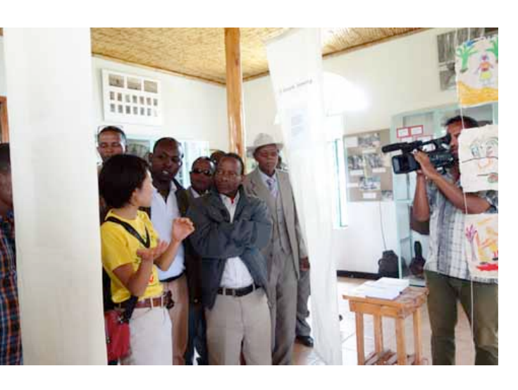
Photo 4 Inauguration on the opening day. SORC invited local governors and users of the library attached to the museum

Photo5 Several quizzes were prepared for museum visitors and photographs of ensete usage (right side). Ensete drawing by school children (left side)