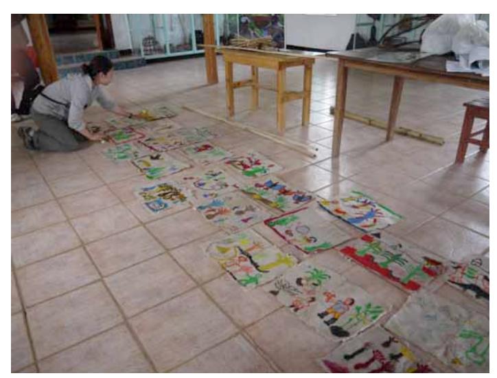
Photo2 Confirming the position of each ensete drawing at the exhibition

Photo 1 Ensete paper, which is made from ensete fiber. School children draw their daily activities related to ensete