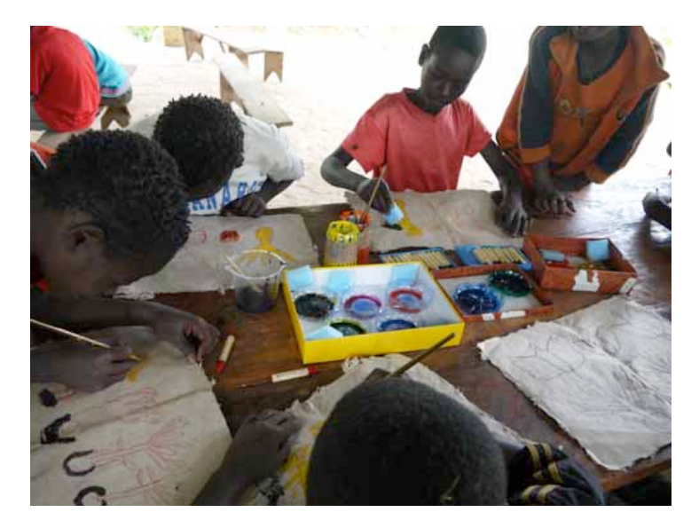
Photo 1 Ensete paper, which is made from ensete fiber. School children draw their daily activities related to ensete

We are preparing future research activities to document the whole process of this special exhibition, and we will give a presentation at an international conference on the Museum that is organized by the Institute of Ethiopian Studies, Addis Ababa University in the beginning of November. In addition, I am going to assist with the next special exhibition after November. In this special exhibition, we will form a bridge between research outcomes and development activities, such as producing ensete fiber products with school students. I exchanged ideas with local staff on objects at South Omo.