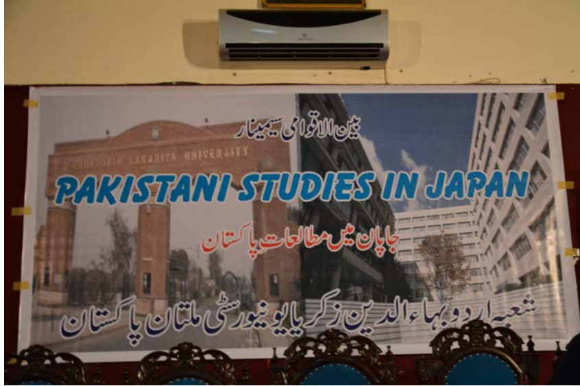
Photo 1: International seminar at Bahauddin Zakariya University, Multan