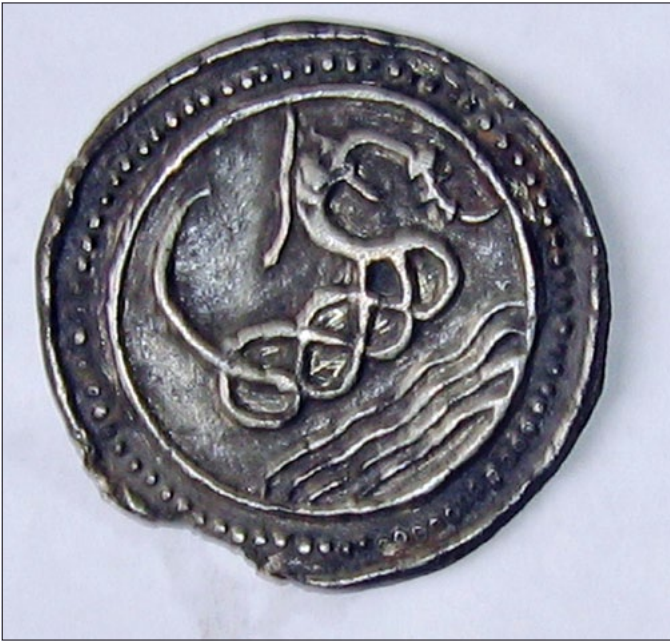
Fig. 4: Lead coin (10 cm), Collection Than Swe (Dawei)

Seals' ( Kotmai Tra Sam Duang ) (Ishii 1998). In 1826, Lower Myanmar and Tanintharyi Division were ceded to the British who were quick to document routes to Thailand and demarcate the border. An 1826 map of Dawei, for example, includes Kaleinaung of the Dawei chronicle, the starting point from which the Dawei River is navigable, and a route to Thailand. Kaleinaung is also marked on a 19 th century Siamese royal military map and a 1917 geological survey (Hearn 1917, Pasuk Santanee 2004). By the early 20 th century, the British administrative documents focused on the isolation of the region, documenting routes east to the disputed border and Siamese elephant stealing (NAD 1919).