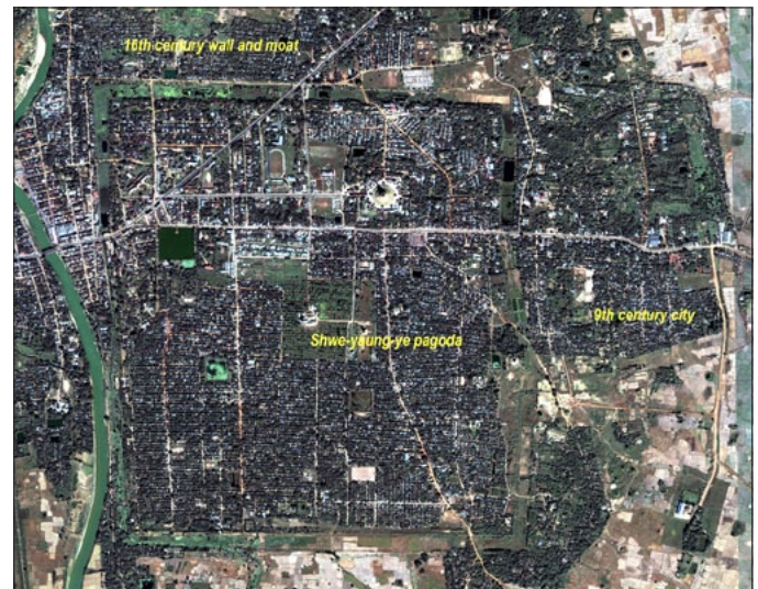
Fig. 3: Bago in 2002, IKONOS, Geo-referenced courtesy Surat Lertlum, CRMA

claim to the seaward side of the Tanintharyi peninsula. The process internationalized Bago but in Dawei, apart from a few stupas said to be 'Thai-style,' the isolation and conquest as a region rather than a center, encouraged an insular pride with a strengthening of local modes and styles. The historical sketches end with World War II images from the Williams-Hunt Collection as comparison of these with present day images can help us contrast the rapid expansion of Bago and the relatively stable Dawei landscape. 5