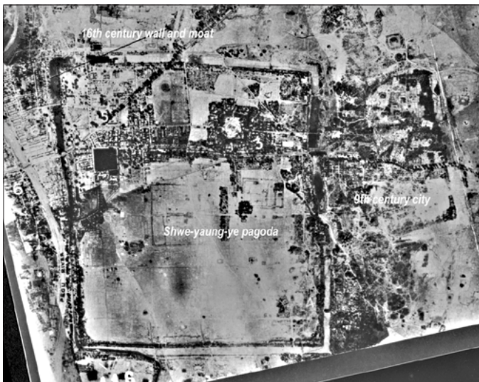
Fig. 2: Bago in 1942, Williams-Hunt Collection, Geo-referenced courtesy Surat Lertlum, CRMA