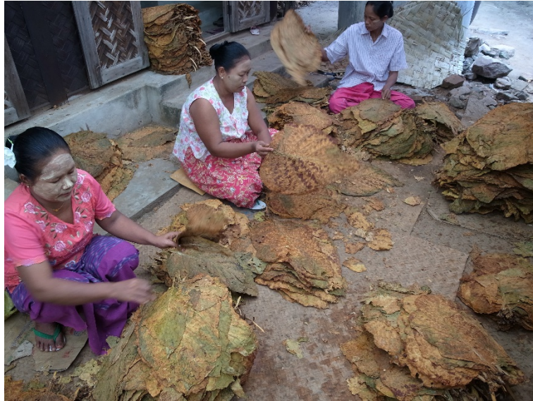
Figure 3. Classification of cured tobacco leaves in a village. (Myingyan Township, Mandalay Region, in August 2017)