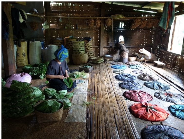
Figure 4. Pressing and drying thanatphet leaves by the stove. (Kyautaloungyi Sub-Township, Southern Shan State, in August 2013)