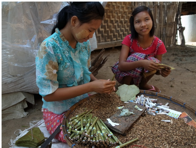
Figure 2. Cheroot making in a village. Chopped tobacco leaves and other ingredients were being wrapped in a shaped thanatphet leaf. (Myingyan Township, Mandalay Region, in August 2017)