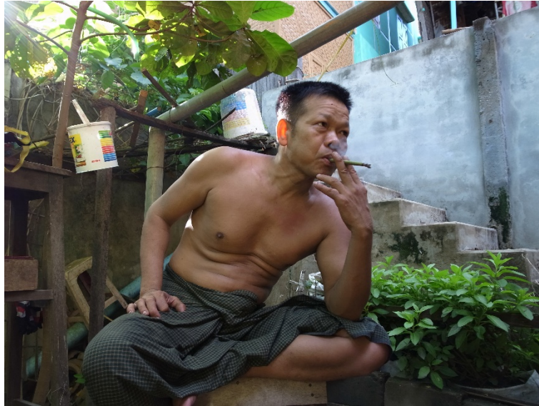
Figure 1. Burmese man smoking a cheroot. (Myingyan Township, Mandalay Region, in August 2017)